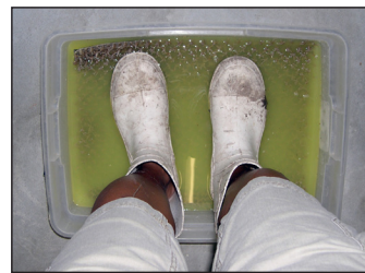
Figure 1. Mobile footbath made from a shallow container.

To help prevent the introduction of diseases, use disinfectant footbaths, hand-washing stations or alcohol spray bottles, net disinfection stations, showers, and vehicle disinfection stations. These should be placed in strategic locations (including at entrances and between systems) to make them easy to use and to maximize their effectiveness.