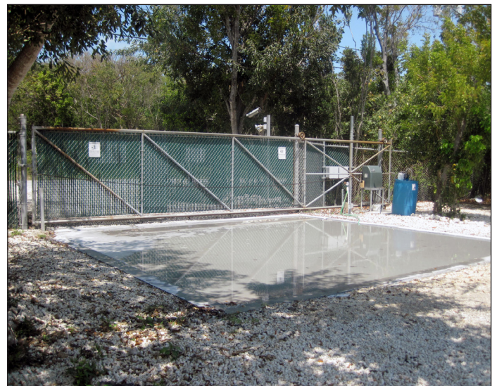
Figure 6. A drive-through disinfection area, consisting of a shallow area filled with disinfectant, to disinfect vehicle wheels.

Vehicle disinfection stations. Vehicles that travel from one facility to another may transport pathogens on their wheels. Having drive-through areas filled with disinfectant at entrances and exits can help reduce this risk (Fig. 6). If a facility is known or suspected to have an outbreak of an important disease, scrubbing stations, where vehicles can be scrubbed more thoroughly with brushes and disinfectant, may be necessary.