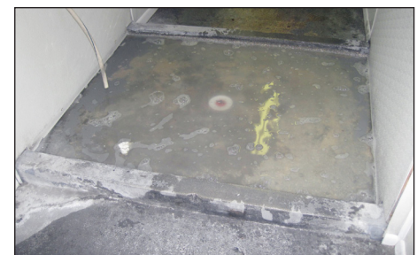
Figure 3. Concrete footbath built into the floor of the hallway.