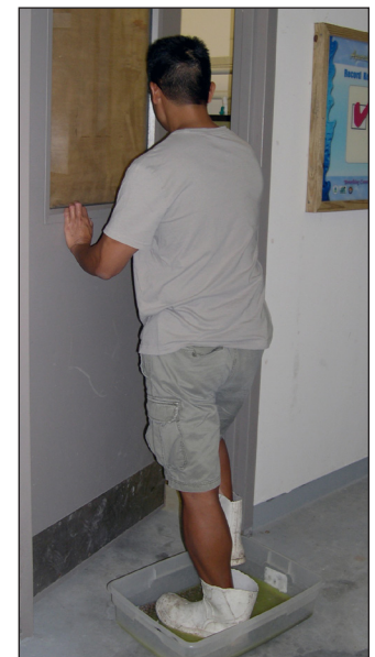
Figure 2. Footbath placed at the entrance to a room.

Footbaths. Commercial footbaths are available, but any shallow container or absorbent padded material can be used (Figs. 1–3) if managed properly. Virkon® Aquatic, chlorhexidine, or chlorine compounds (sodium or calcium hypochlorite) are commonly used, but chlorine is harsh on many materials. Virkon® Aquatic diluted according to instructions is considerably safer than chlorine products.