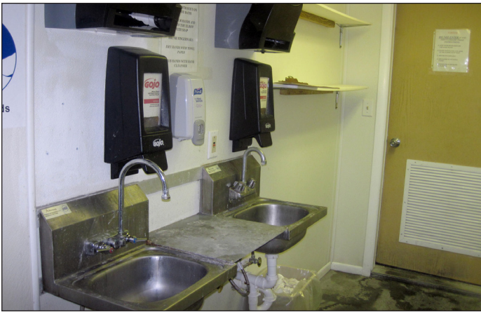
Figure 4. Hand washing station.

Hand washing Hand washing alone with soap and water will remove a significant number of pathogens (Fig. 4). Using an antiseptic will further reduce risks. One option is a product with 60 to 90% alcohol, either straight rubbing alcohol (isopropyl), which can be applied with a spray bottle, or a gel product. Alcohol can dry the skin. Antibacterial soaps may also provide some level of protection, but be aware of any additives such as perfumes that might be toxic in the water.