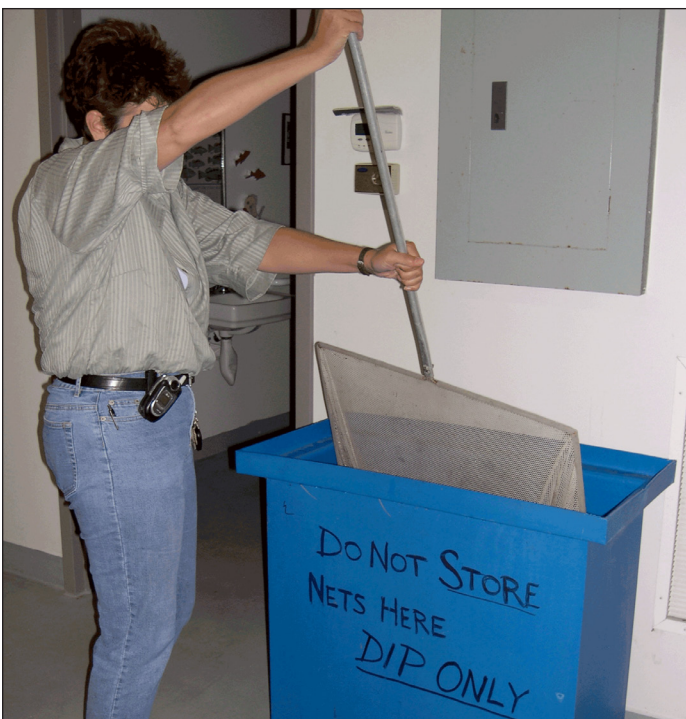
Figure 5. Net disinfection station.

Net disinfection stations (net dips). Nets should be disinfected after use to prevent the spread of pathogens from one group of fish to another. Net dips should be sized and filled to allow complete submersion of the net and, if possible, the portion of the handle that may be submerged during use (Fig. 5). Stations should be strategi-